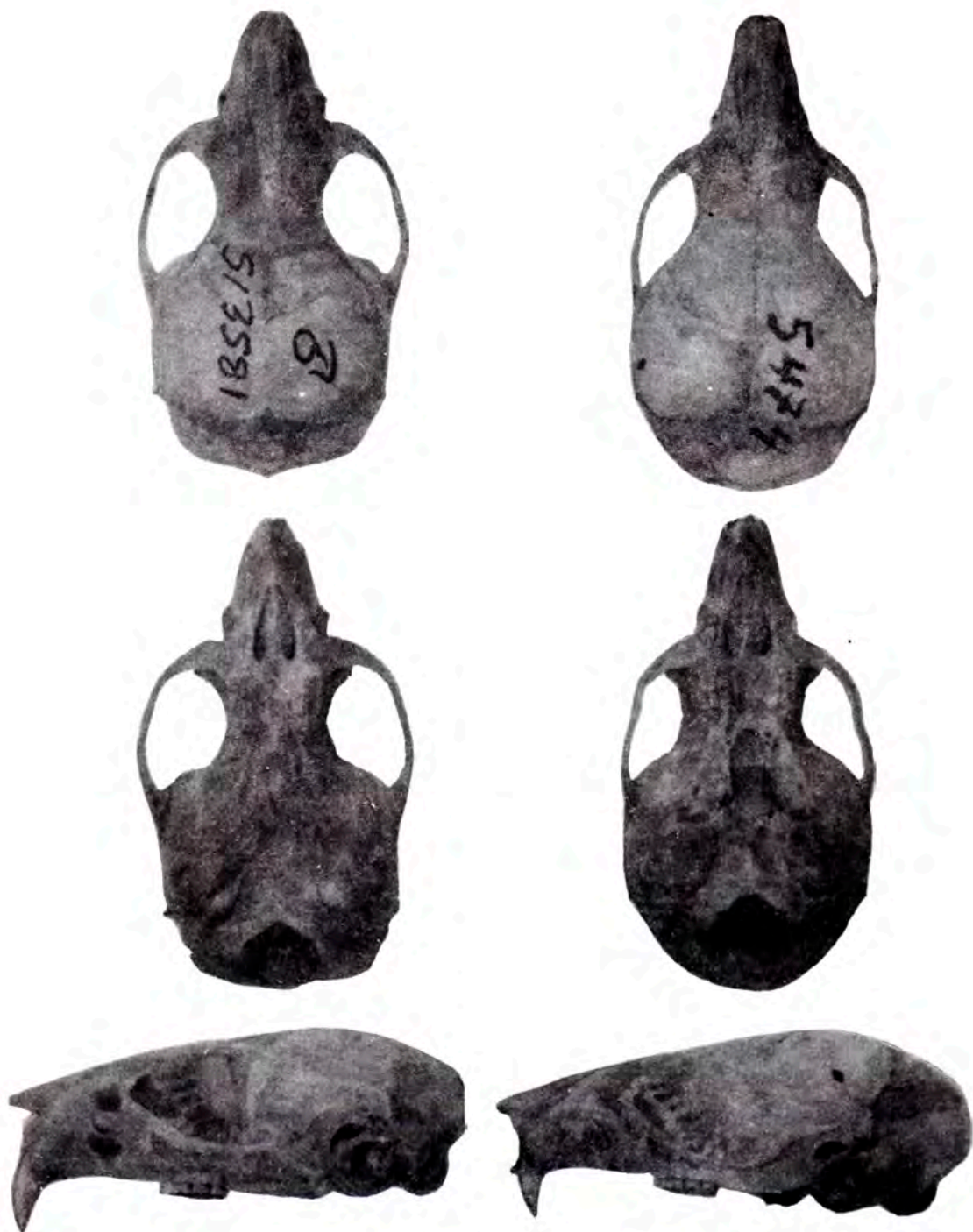
Fig. 1.- Dorsal, ventral and lateral views of S. ucayalensis (MUSM 5474, right) compared with S. melanops (USNM 513581, left).