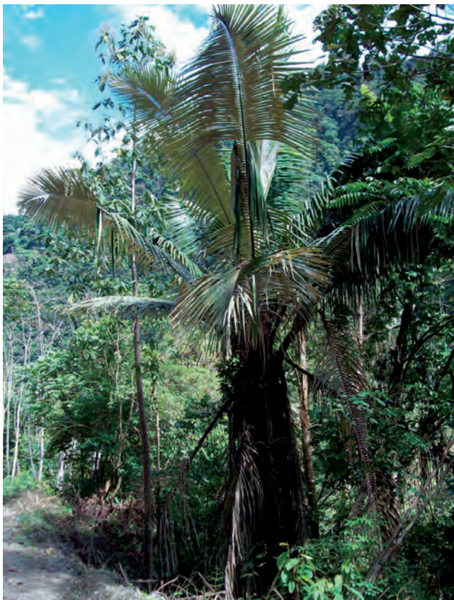
Figure 2. Astrocaryum perangustatum : adult palm.

Survey area. — Our study area is located in Pozuzo region,