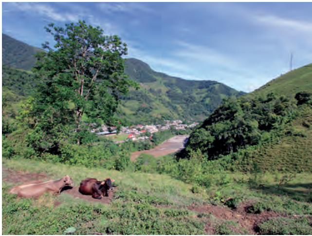
Figure 1. Pozuzo landscape.

stem, at least in its upper part under the crown (Fig. 2). Leaves are regularly pinnate and disposed in one plane. Inflorescences and infructescences are erect and emerge from between the leaf bases. Fruits have the shape of an inverted cone with a remarkably long tapering base. Seedlings have entire, bifid leaves (Fig. 3).