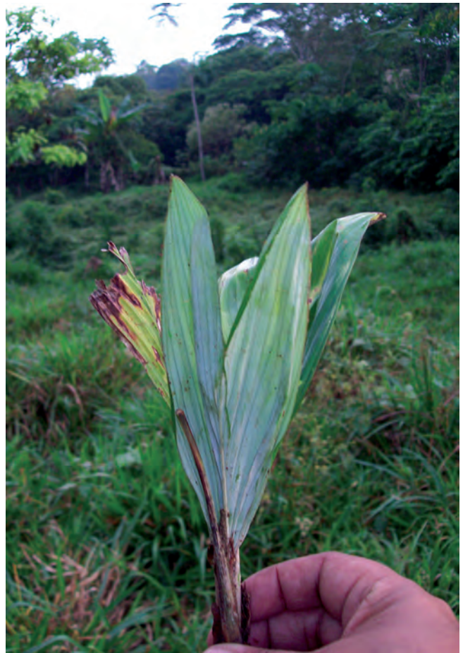
Figure 3. Astrocaryum perangustatum : seedling.